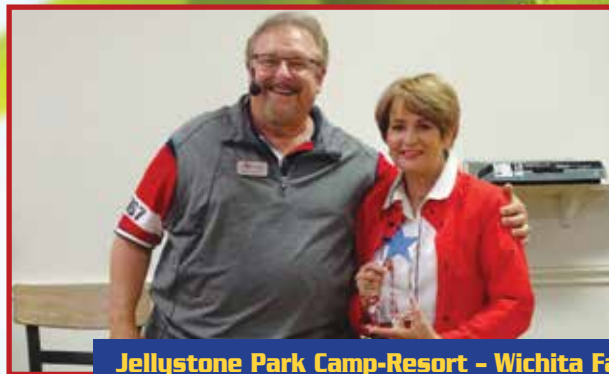
Jellystone Park Camp-Resort – Wichita Falls Large Park of the Year