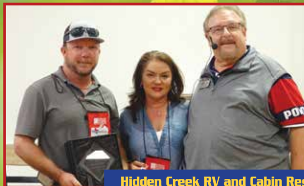
Hidden Creek RV and Cabin Resort Small Park Accommodations of the Year