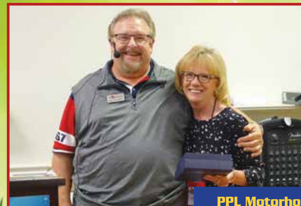
PPL Motorhomes Supplier of the Year