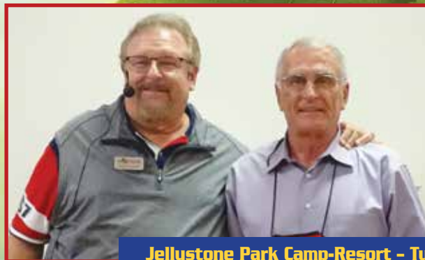
Jellystone Park Camp-Resort – Tyler Medium Park of the Year